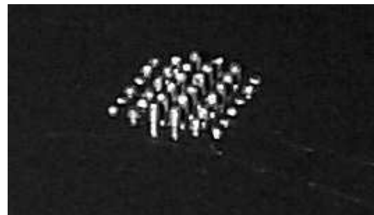
Figure 2. The 6x6 display showing a two-dimensional sine wave