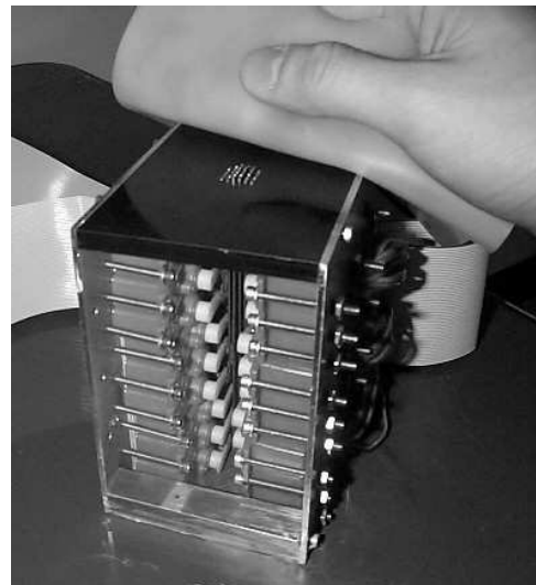
Figure 1. The full tactile display